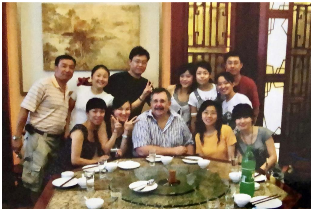
(Some of my staff)