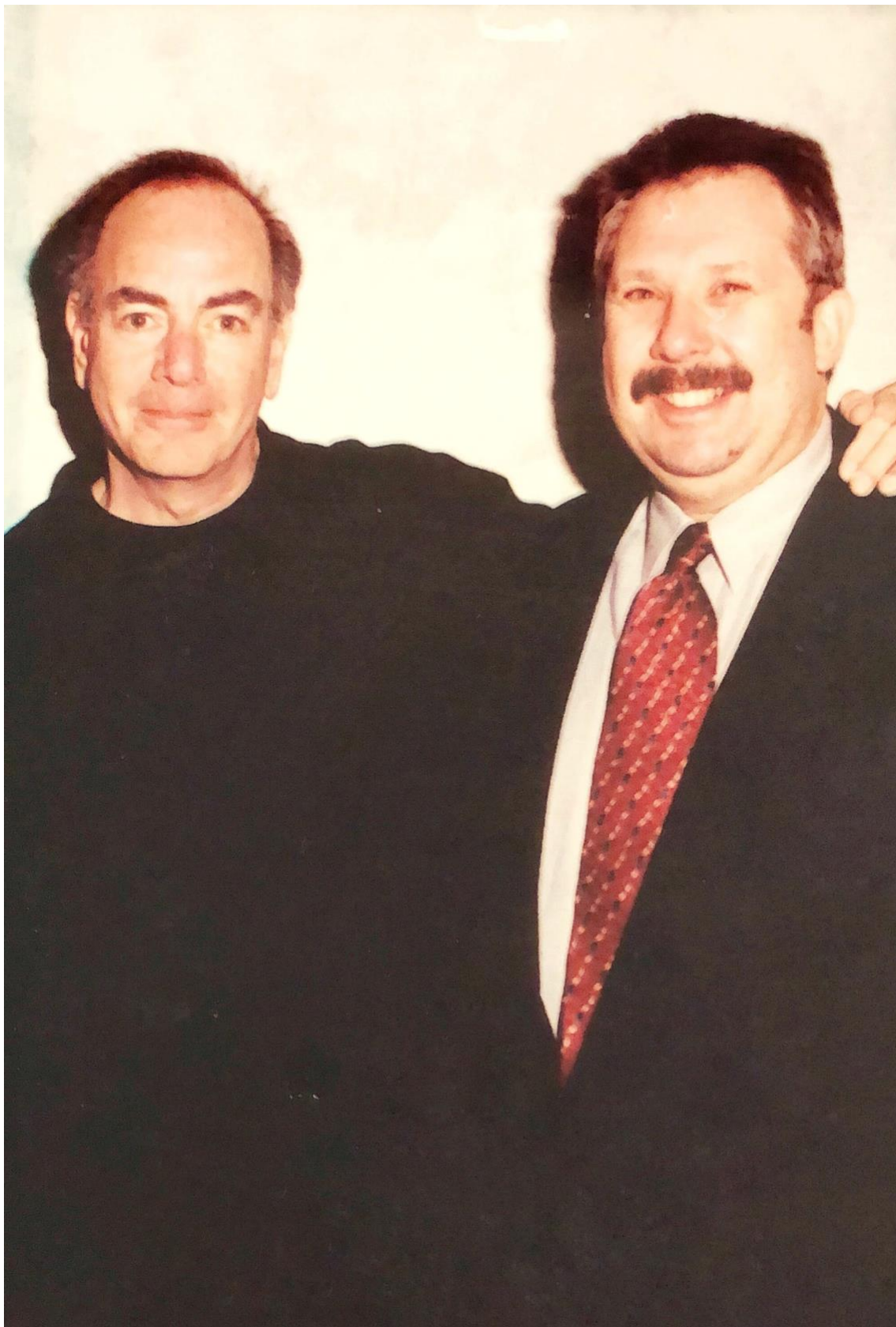
(Neil Diamond & me at Warringah Mall)

I was also Centre Manager of Warringah Mall, for three years where I also managed two large extensions. And then I became Regional Manager for the AMP Shopping Centres in New Zealand and NSW.